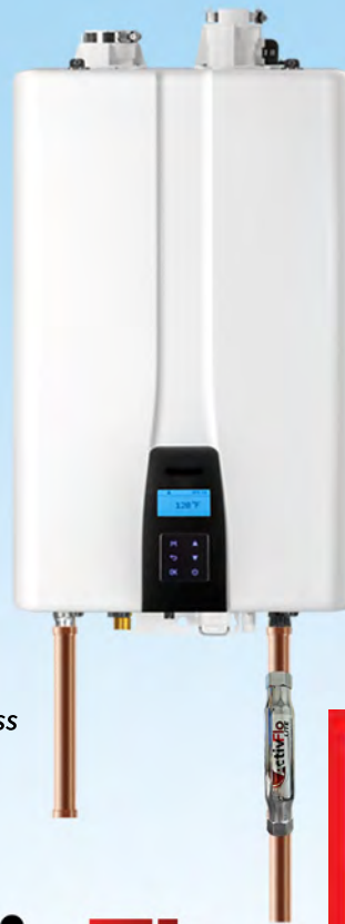
The ActivFlo Lite Attached to Tankless Water Heater

*Protects heating elements from calcium build-up like photo below