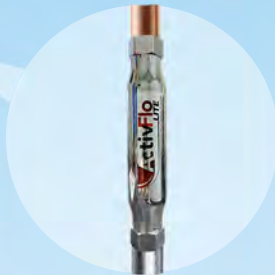
The ActivFlo Lite Attached to Water Heater